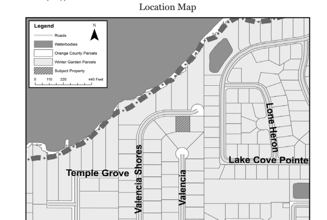
March 18, 2021 21-00771W