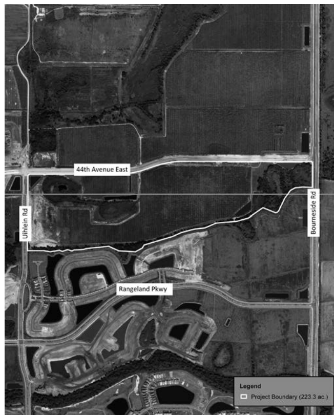
Exhibit A: Engineer's Report for Sweetwater Project , dated May 5, 2021 Exhibit B: Master Assessment Methodology Report Lakewood Ranch Stewardship District Northeast Sector Sweetwater Project Area , dated May 2021