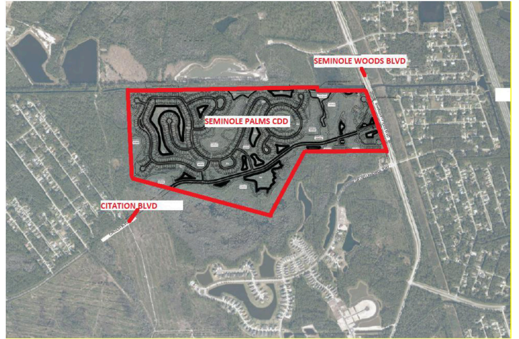
March 17, 24, 2022

Exhibit B: Master Special Assessment Methodology Report, dated January 27, 2022