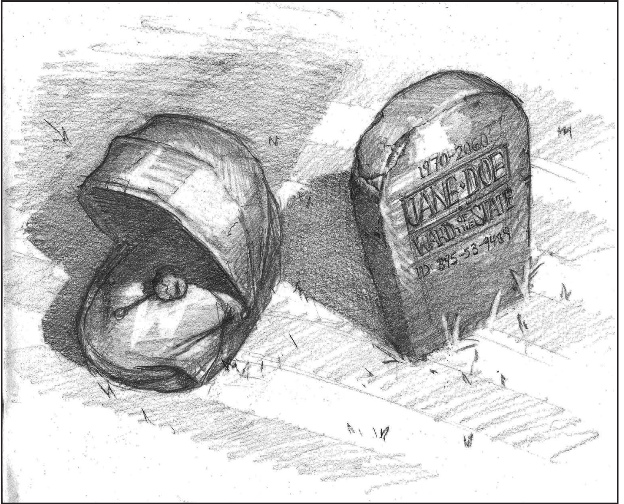
ILLUSTRATION BY SEAN MICHAEL MONAGHAN

belief in individual responsibility, laissez faire and a decentralized and limited government to belief in social responsibility and a centralized and powerful government. It was the function of government, they believed, to protect individuals from the vicissitudes of fortune and to control the operation of the economy in the “general interest,” even if that involved government ownership and operation of the means of production.