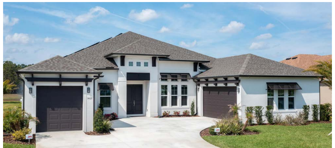
The house at 1405 Lilly Anne Lane has 3,270 square feet of living space.