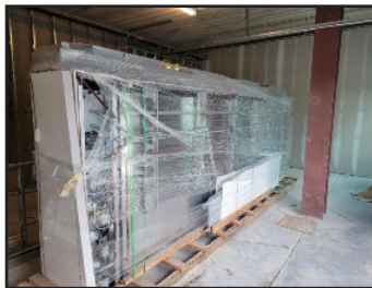
The exhaust hood is large and heavy, measuring over 30 feet long and weighing hundreds of pounds.

Location of Public Sale: 5246 N. Florida Ave., Suite 101, Tampa, FL 33603 Time of Public Sale: Friday, July 21, 2023 at 10:00 a.m. Property being Sold: Custom exhaust hood built for the formerly leased premises pictured as follows: