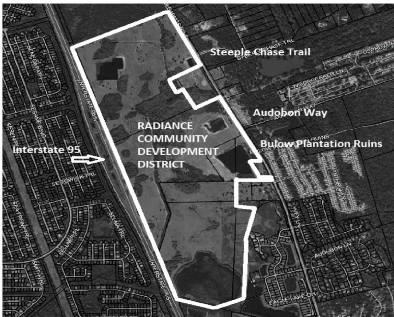
August 3, 2023