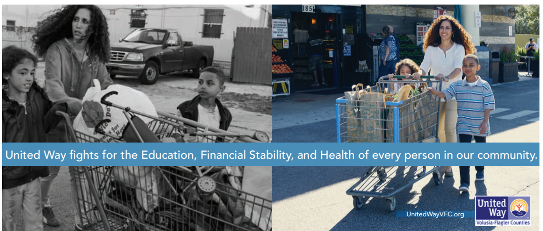
United Way fights for the Education, Financial Stability, and Health of every person in our community.