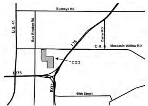
Exhibit A: Engineer's Report, dated November 5, 2023 Exhibit B: Master Special Assessment Allocation Report, dated November 13, 2023

ATTEST: SOUTHPOINTE OF MANATEE COUNTY COMMUNITY DEVELOPMENT DISTRICT Secretary/Asst. Secretary Chairman