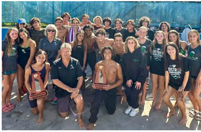
The Father Lopez boys swim team won the District 3-1A title, while the girls finished second.