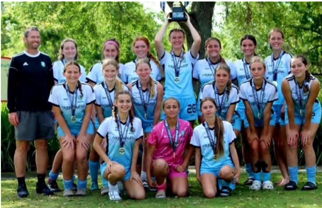
The Inter-United Soccer Club of Palm Coast 2009 girls team (16U) won the United States Youth Soccer Commissioner's Cup championship on April 6.

Seabreeze to host district championship Seabreeze will host Belleview in the District 5-5A baseball championship on Thursday, April 17, at 7 p.m. The Sandcrabs defeated Matanzas 13-1 in the semifinals on April 15. The Pirates defeated Gainesville 5-3 on the road in a quarfinal game on April 14