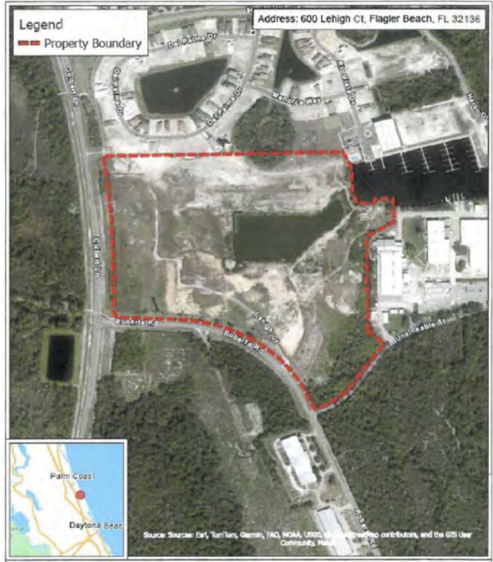
Exhibit B: Master Special Assessment Methodology Report, dated August 13, 2025

Exhibit A: District Engineer's Report, dated May, 2025